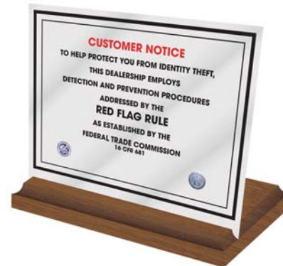
Desk Sign – Optional